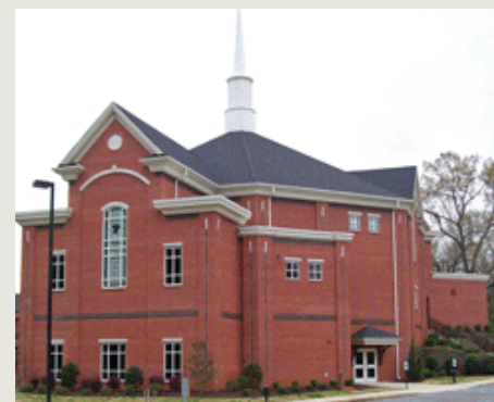
East Highland Baptist Church