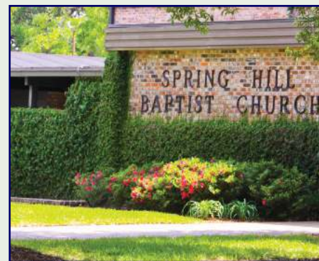
Spring Hill Baptist Church