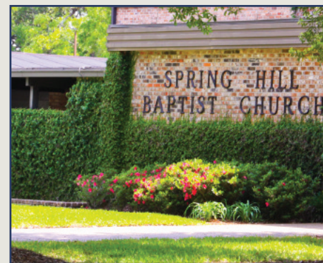
Spring Hill Baptist Church